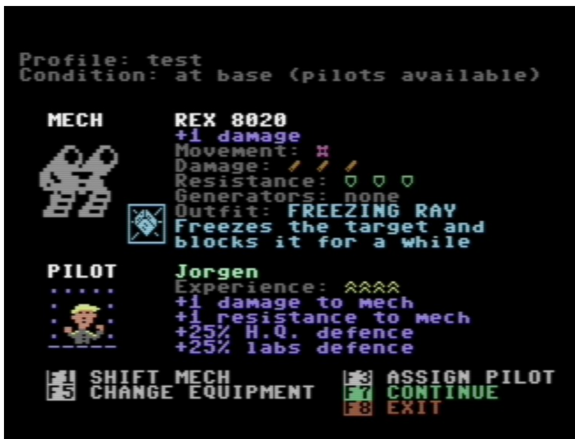
Picture B: The mech management panel, showing one of your two mechs and its pilot.

Then are the name and picture of the assigned pilot, his/her experience level (symbolized by a yellow grade) and the special acquired skills.