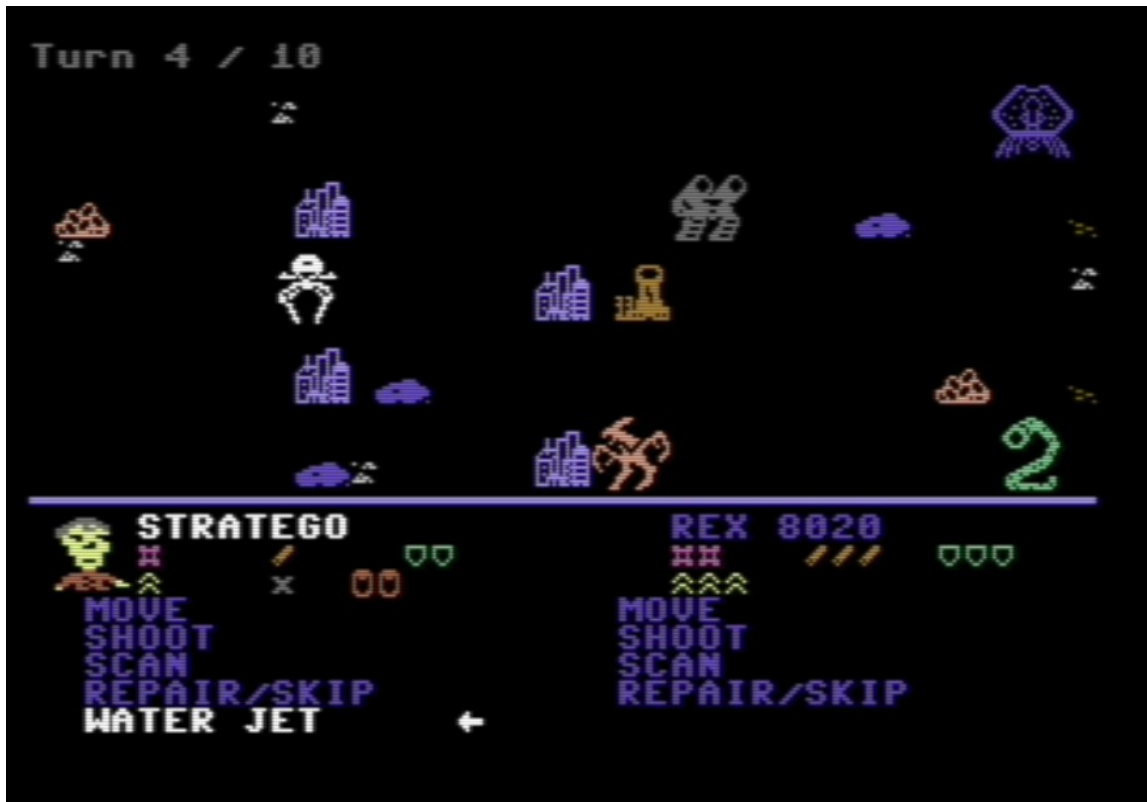
Picture C: The control panel. Note that the mech on the left mounts a special equipment (Water Jet) so the additional action appears among its choices.